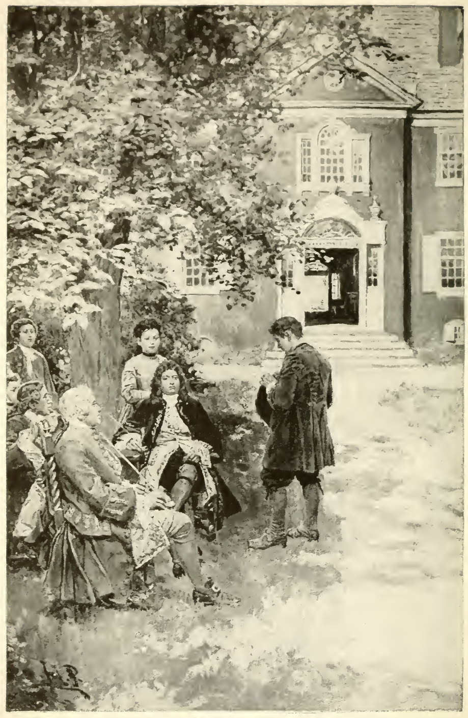
" SPEAK UP, BOY, SPEAK UP, SAID THE GENTLEMAN." (SEE PAGE 90.