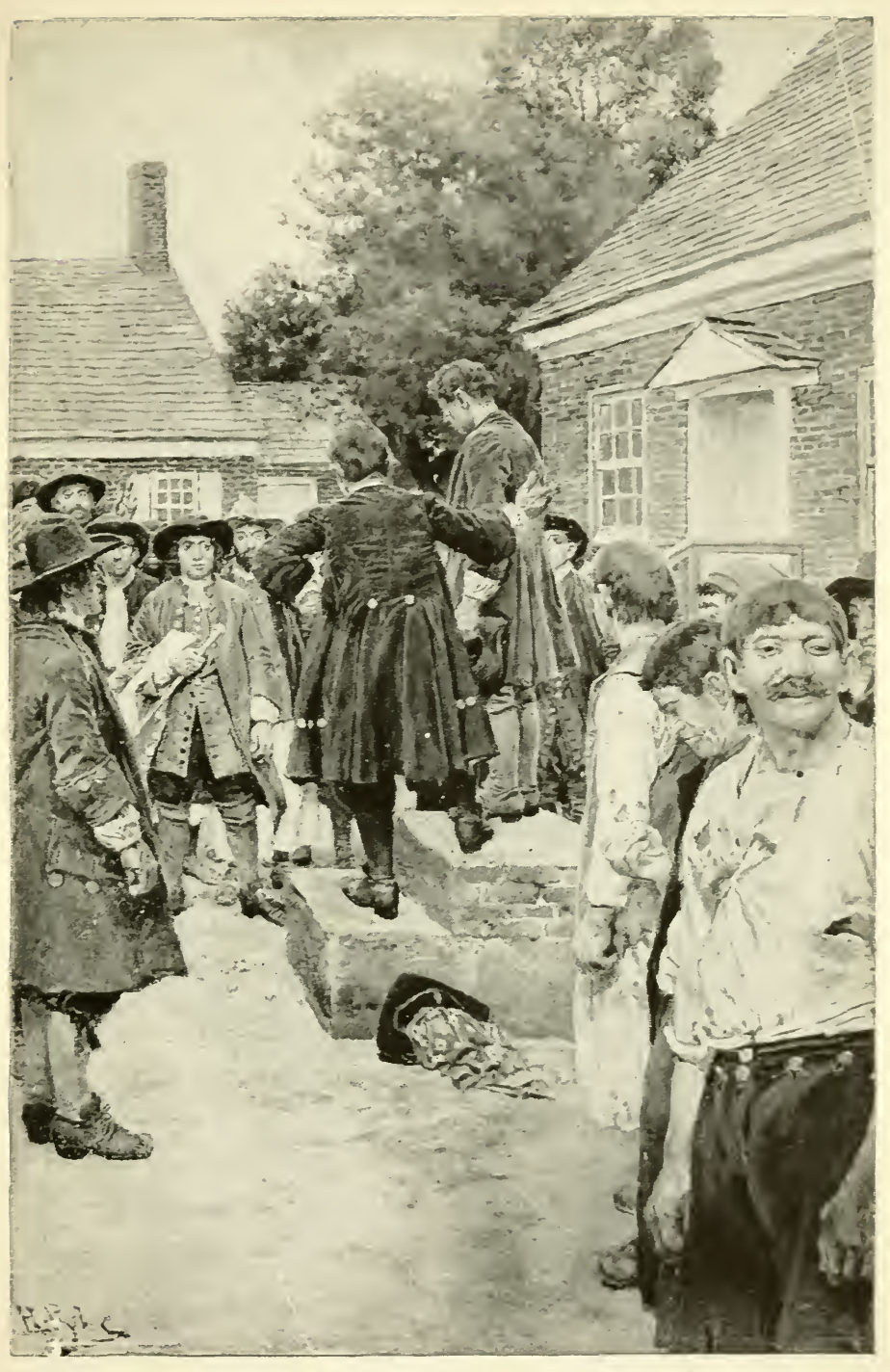
NOW THEN, GENTLEMEN. HOW MUCH DO YOU BID FOR THIS BOY? SAID THE AUCTIONEER."