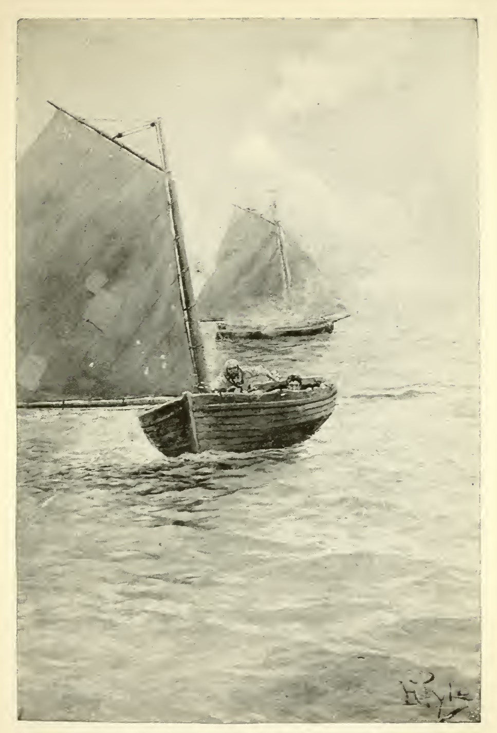
THE PIRATES FIRE UPON THE TUGITIVES.