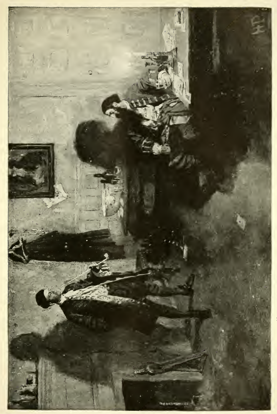
"MR. PARKER STOOD LOOKING STEADILY AT HIS VISITOR,"