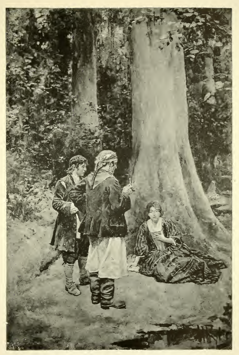
"THEY FOUND HER STILL SITTING IN THE SAME PLACE."