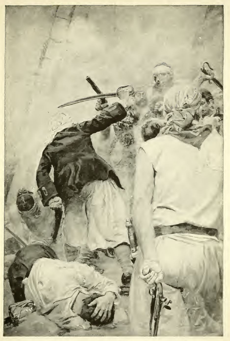
"THE COMBATANTS CUT AND SLASHED WITH SAVAGE FURY."