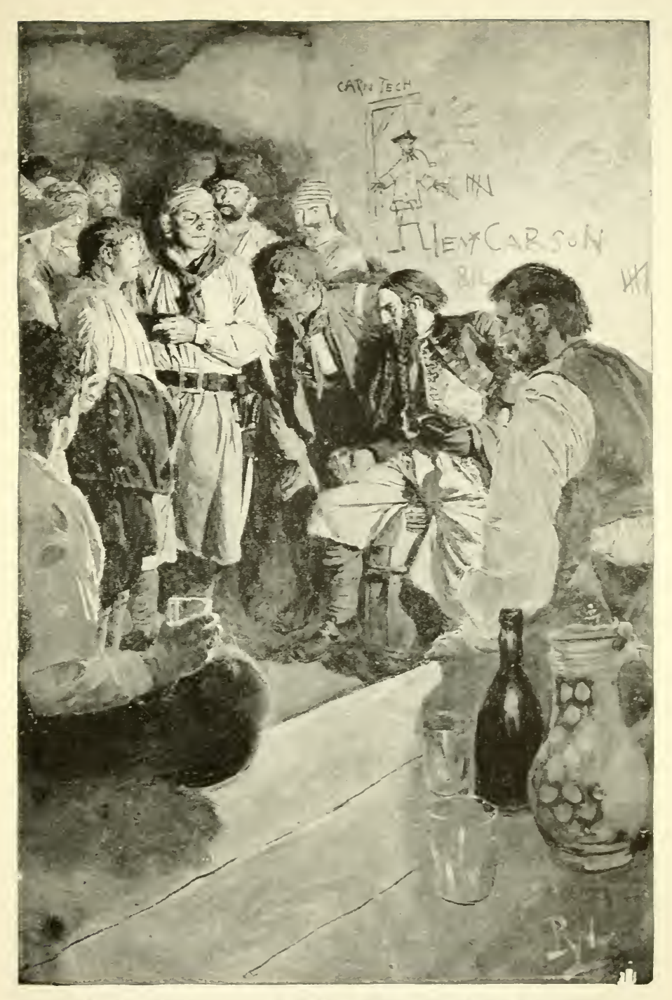
"HE LED JACK UP TO THE MAN WHO SAT UPON A BARREI."